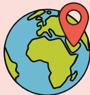
Where I live