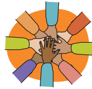
Mutual Respect and Tolerance

Did you know the word democracy originated in Ancient Greece from demos meaning common people and kratos meaning strength?