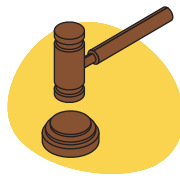
Rule of Law